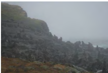
Northern fur seals at Staraya Artil rookery, St. George, Alaska can be seen through a drizzling mist.

NOAA's Office of National Marine Sanctuaries staff reviewed the nomination