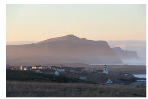
A November sunset lights up the city of St. George, Alaska.