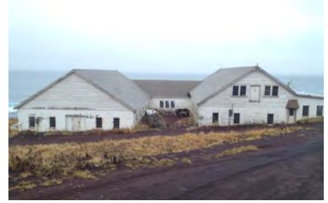
Perhaps the last sealing plant in the world is located on St. George Island.

Comments should not focus at this time on whether NOAA should initiate the designation process for the sanctuary. The <u>11 Sanctuary Nomination</u> <u>Process criteria</u> are available in great detail on the website.